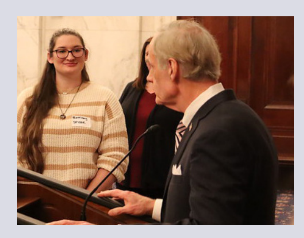
U.S. Senator Tom Carper welcomes Washington Week attendees to Capitol Hill.